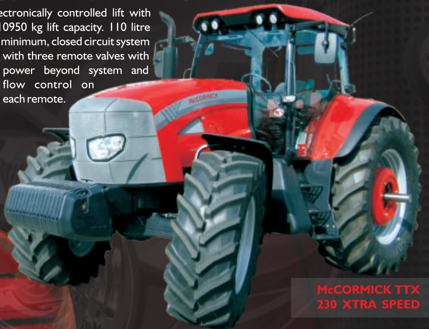
McCORMICK TTX 230 XTRA SPEED

FOR MORE INFORMATION SEE YOUR NEAREST DEALER OR CONTACT: